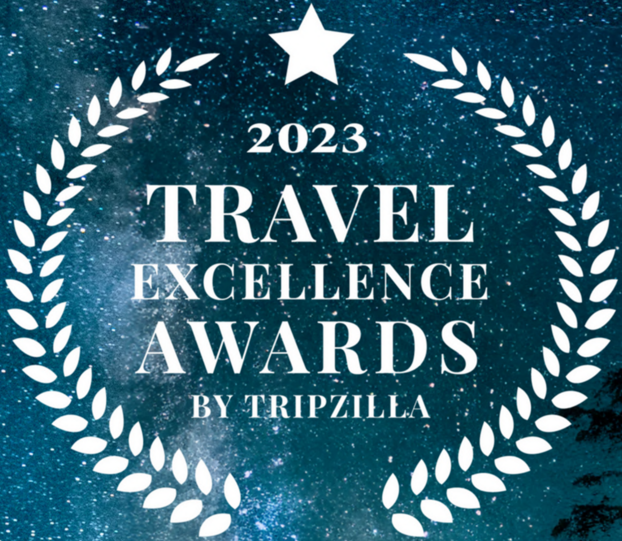
Travel Excellence Awards logo

Prestigious title of “Winner of Category Awarded” and licensed use of the Travel Excellence Awards logo